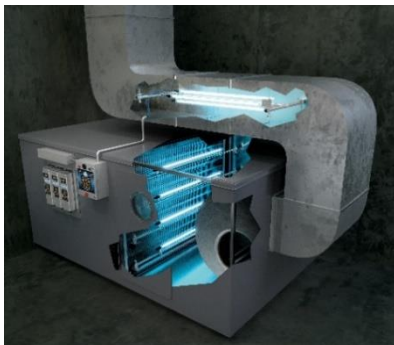
AHU / RTU & Airstream Disinfection