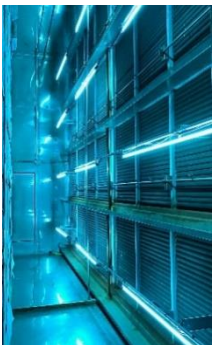
Air Handler Disinfection

For more information on Fresh-Aire UV systems or to discuss your specific application, please contact 1-800-741-1195 or email sales@FreshAirUV.com .